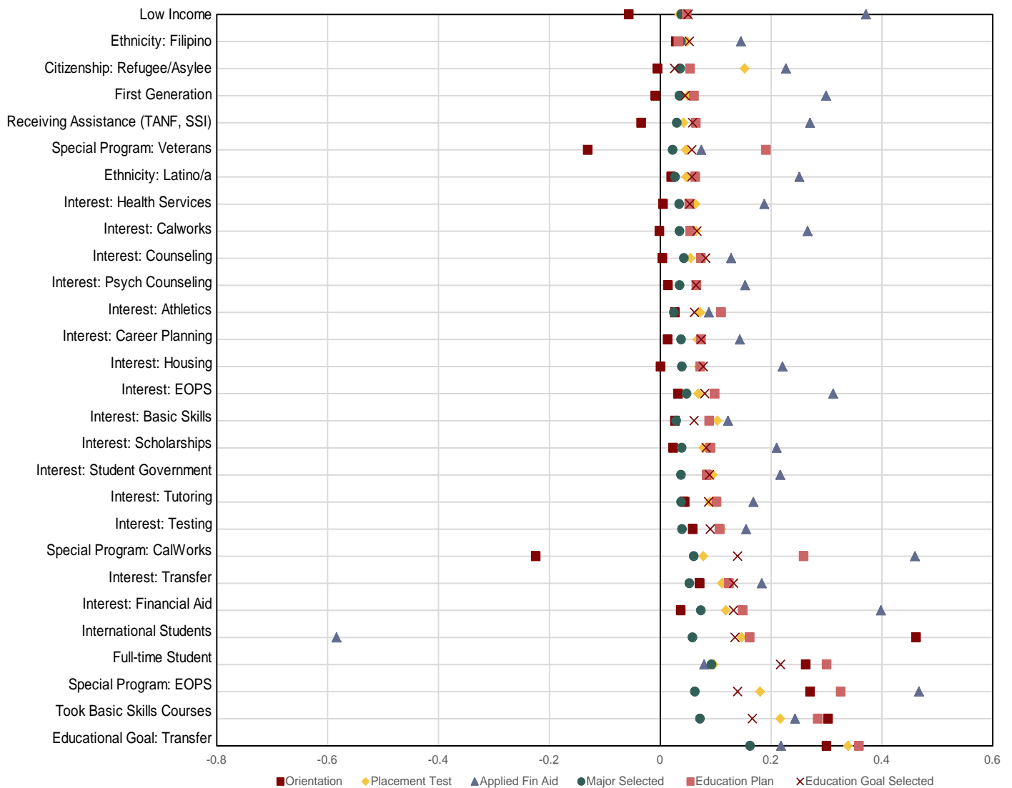
Figure 1. Characteristics of Students and Completion of Matriculation Steps High Levels of Completion (%)

Note: Graphs based on the median levels of completion. Includes highest 28 median values.