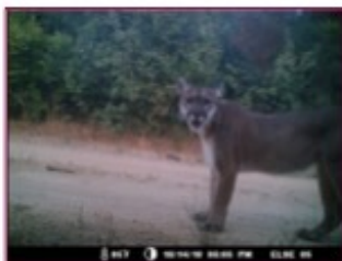
Learn Camera Trapping

Visit: http://www.deanza.edu/students/undoc-students.html for more information.