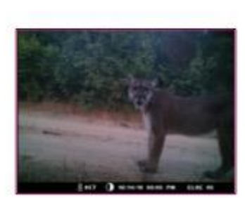
Learn Camera Trapping

Visit: http://www.deanza.edu/students/undoc-students.html for more information.