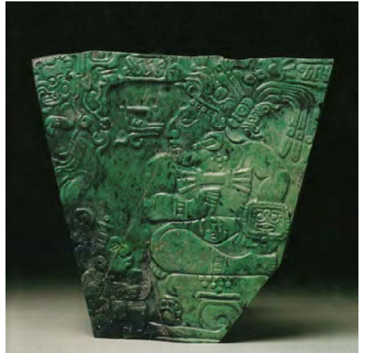
Title / Object Name: Culture / Civilization: Materials: Significance: