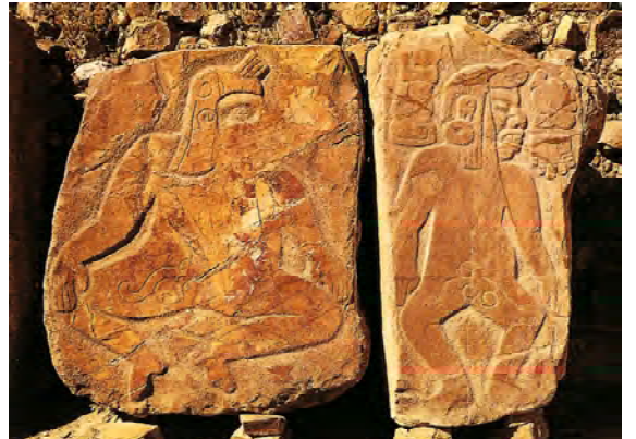
Title / Object Name: Culture / Civilization: Location: Materials: Significance: