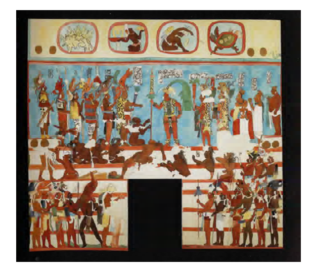
Title / Object Name: