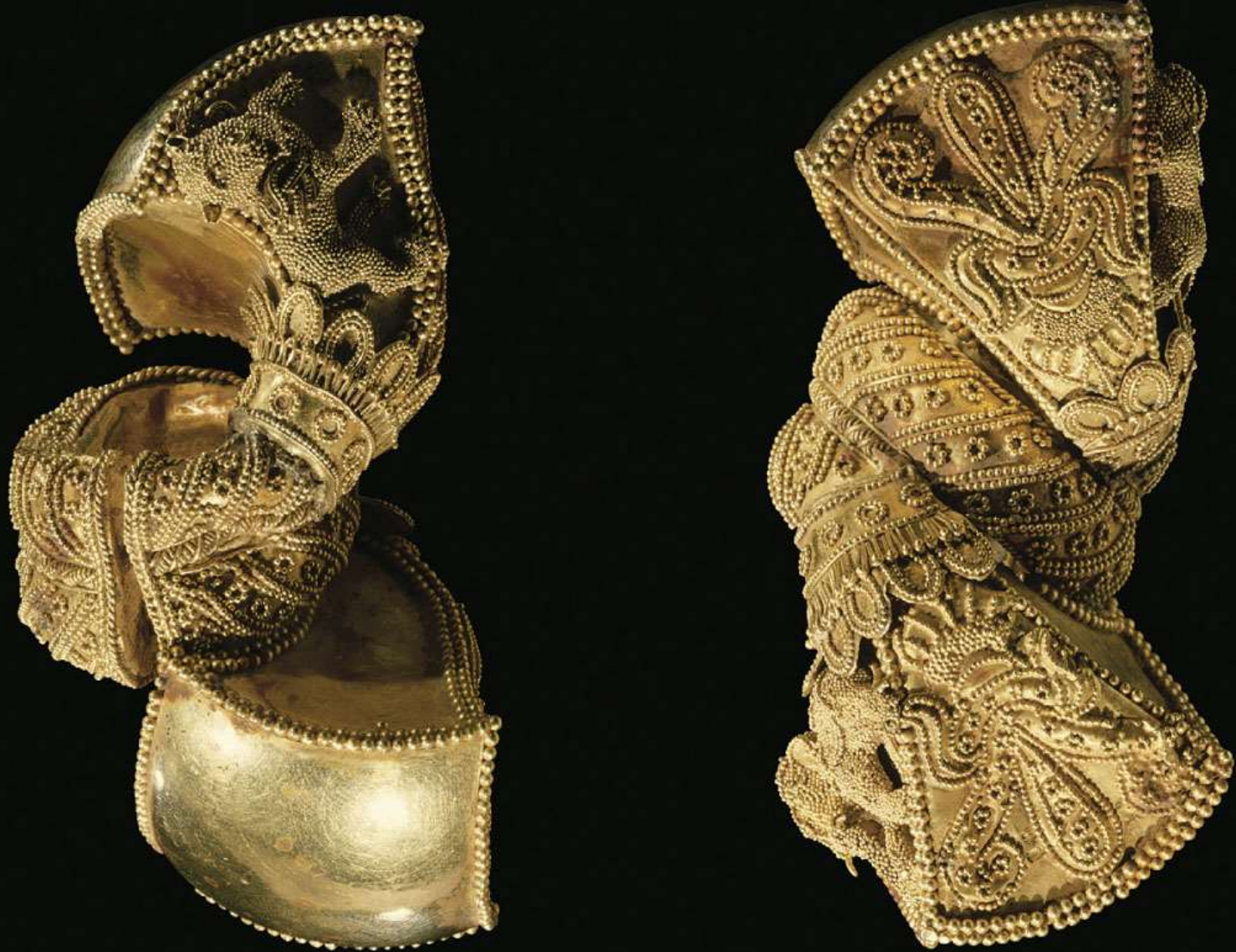
Pair of royal earrings, India, c. 1 st century B.C.E. Gold. Metropolitan Mus.