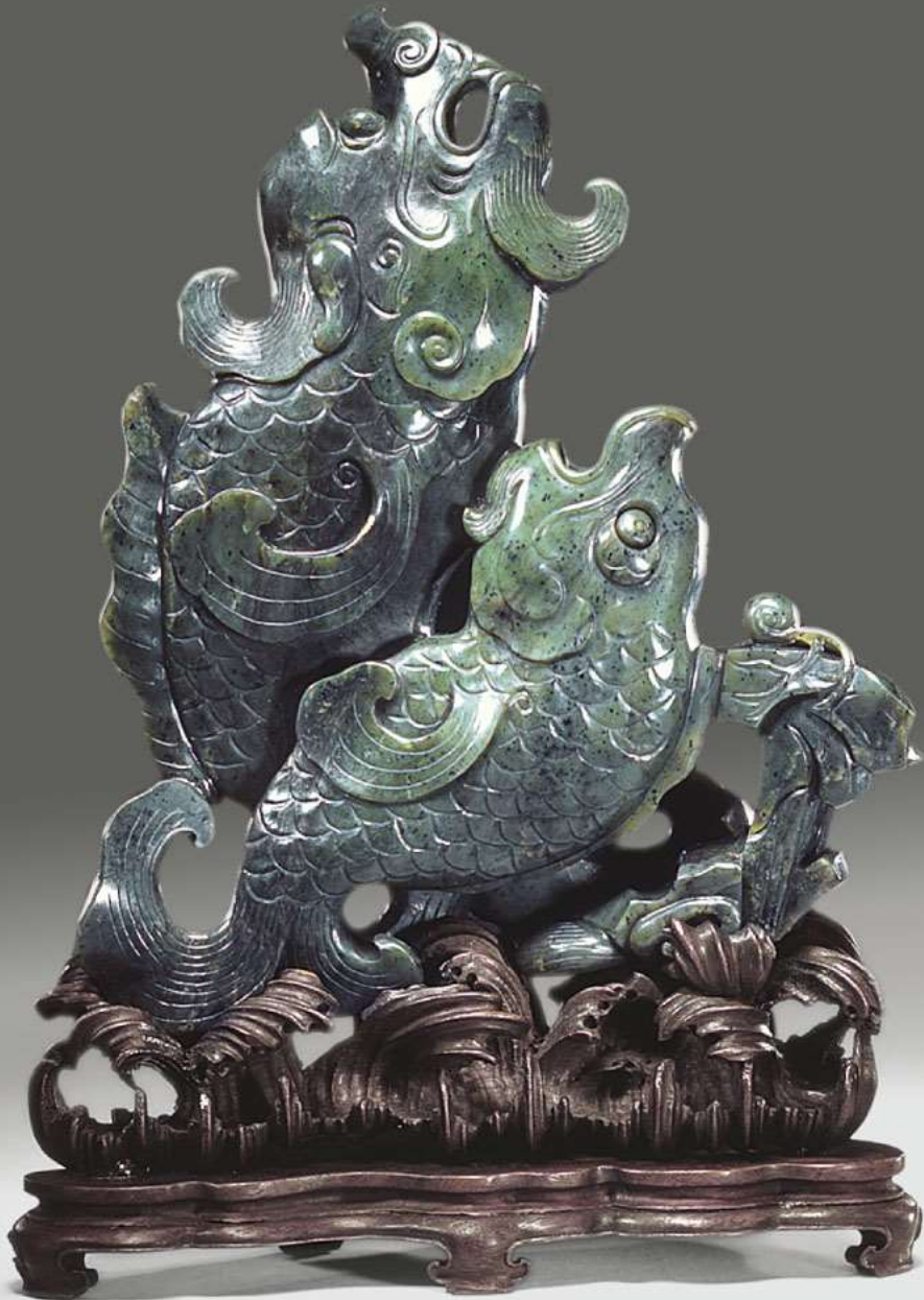
Vase in the form of two carps, China, 18 th century. Jade Height 6 \frac{3}{8} "