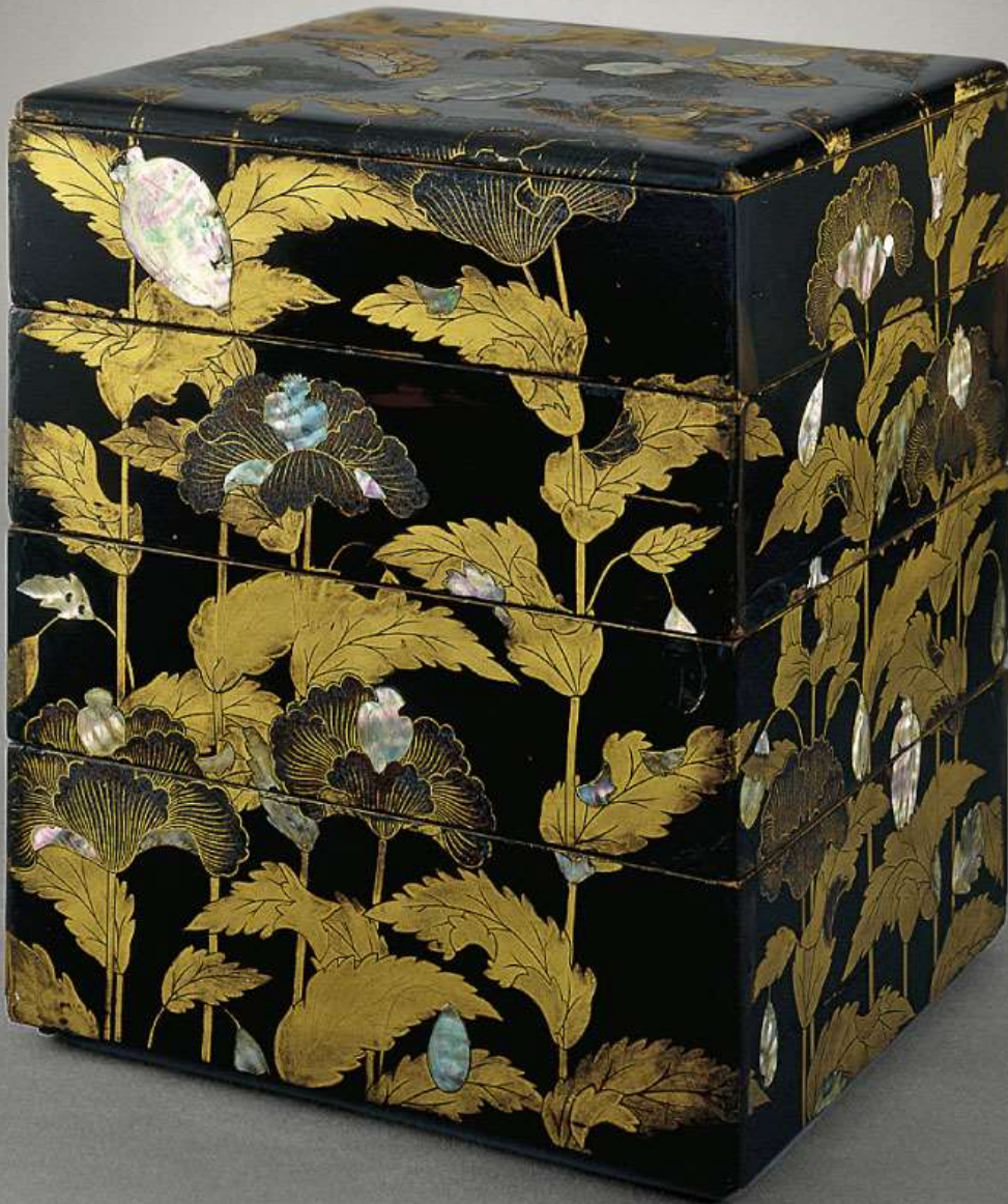
Tiered picnic box, Japan, late-17 th century. Wood, black lacquer, gold and silver powder, shell

Lacquer: The sap of the lacquer tree used to varnish wood or other materials.