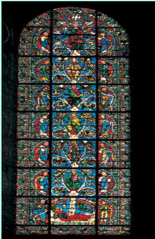
Tree of Jesse, Chartres Cathedral, c. 1150-70. Stained glass