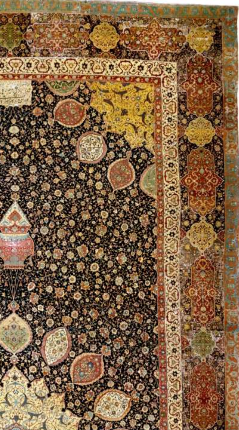
Ardabil Carpet , Persia, 1539-40. Wool pile on silk warps.