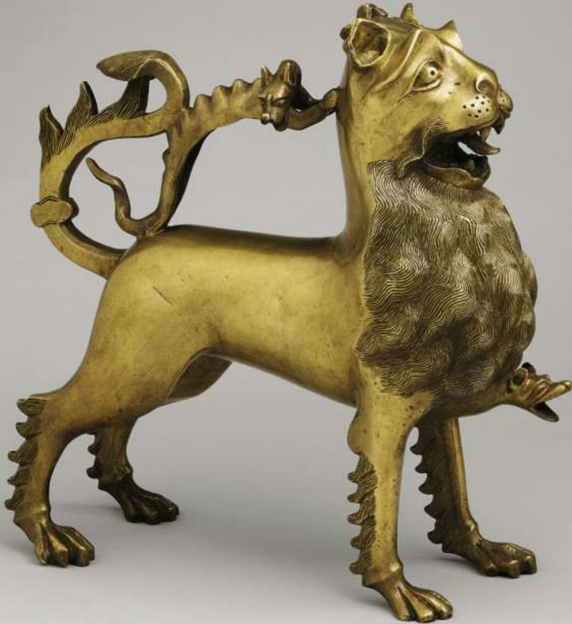
Nuremberg, Lion Aquamanile, c. 1400. Latten alloy, height 13"