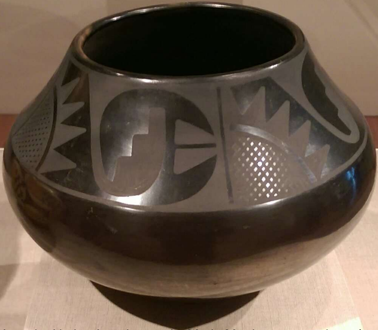
A pot by Native American artist Maria Martinez, approximately 1945, on display at the de Young Museum in San Francisco