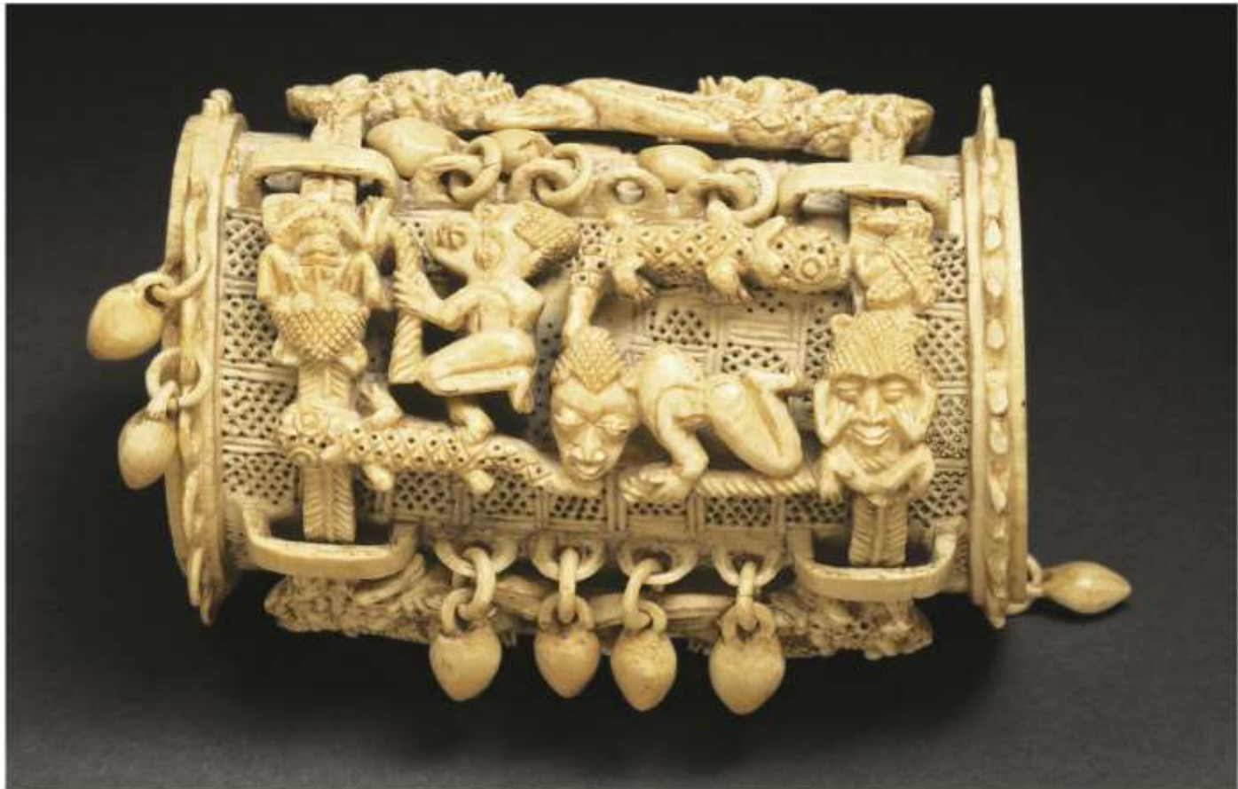
Arm ornament, Yoruba, 16 th century. Ivory