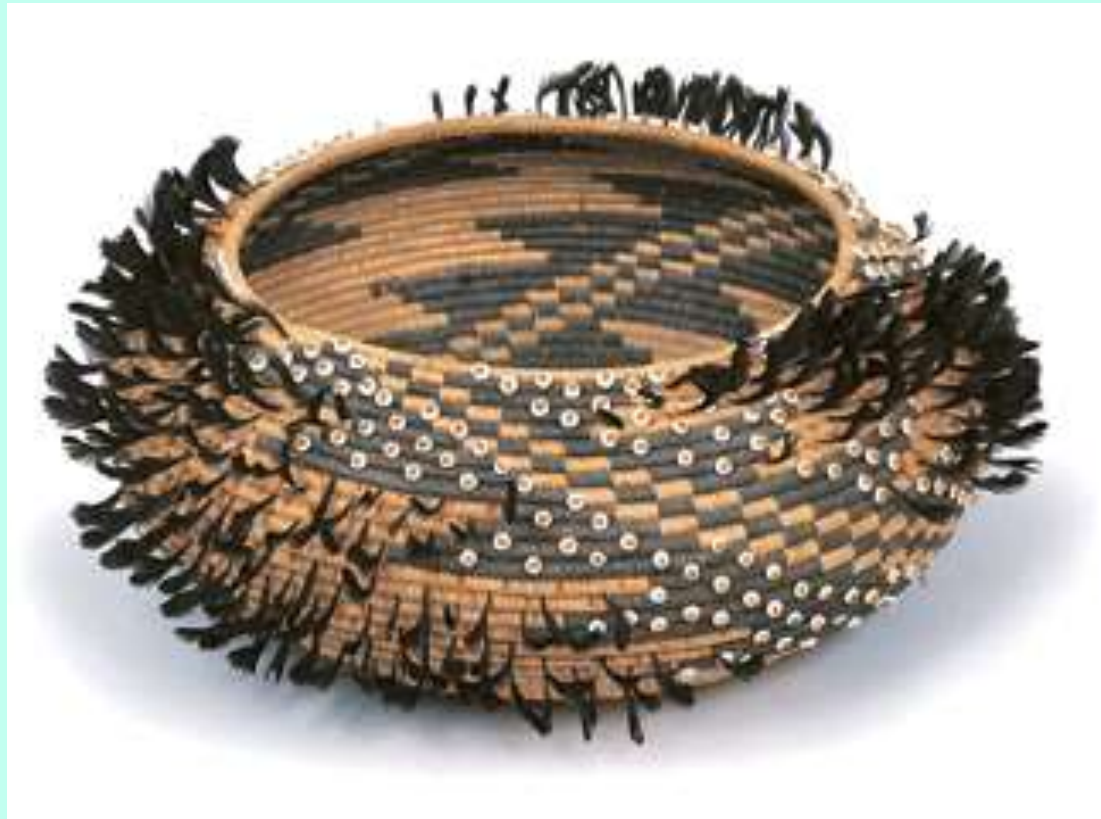
Feathered Basket, Pomo, c. 1877

A narrow strand of vegetable, animal, or synthetic material