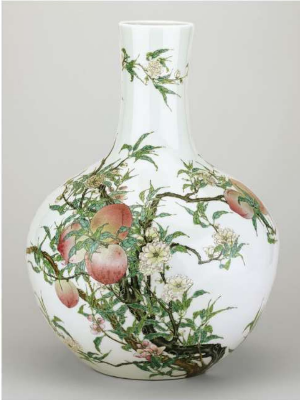
Vase, China, 18 th century. Porcelain with white glaze and overgraze enamel. Height 20". British Museum, London