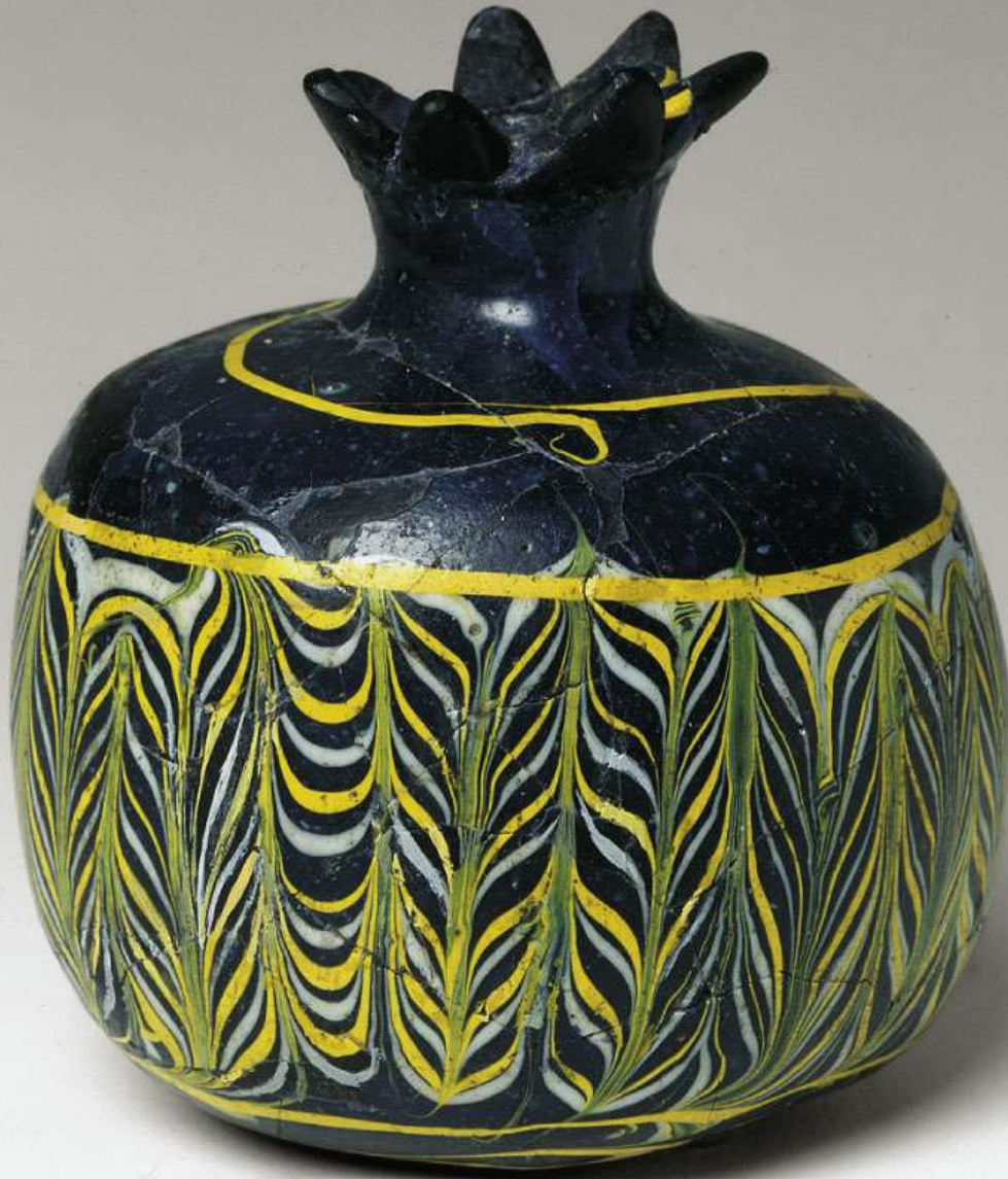
Bottle in the shape of a pomegranate, Egypt, c. 1550-1307. Sand-core glass. Height 4"