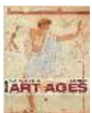
Western, 14 th Ed.