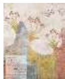
Global, 15 th Ed.