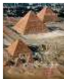
Global, 13 th Ed.