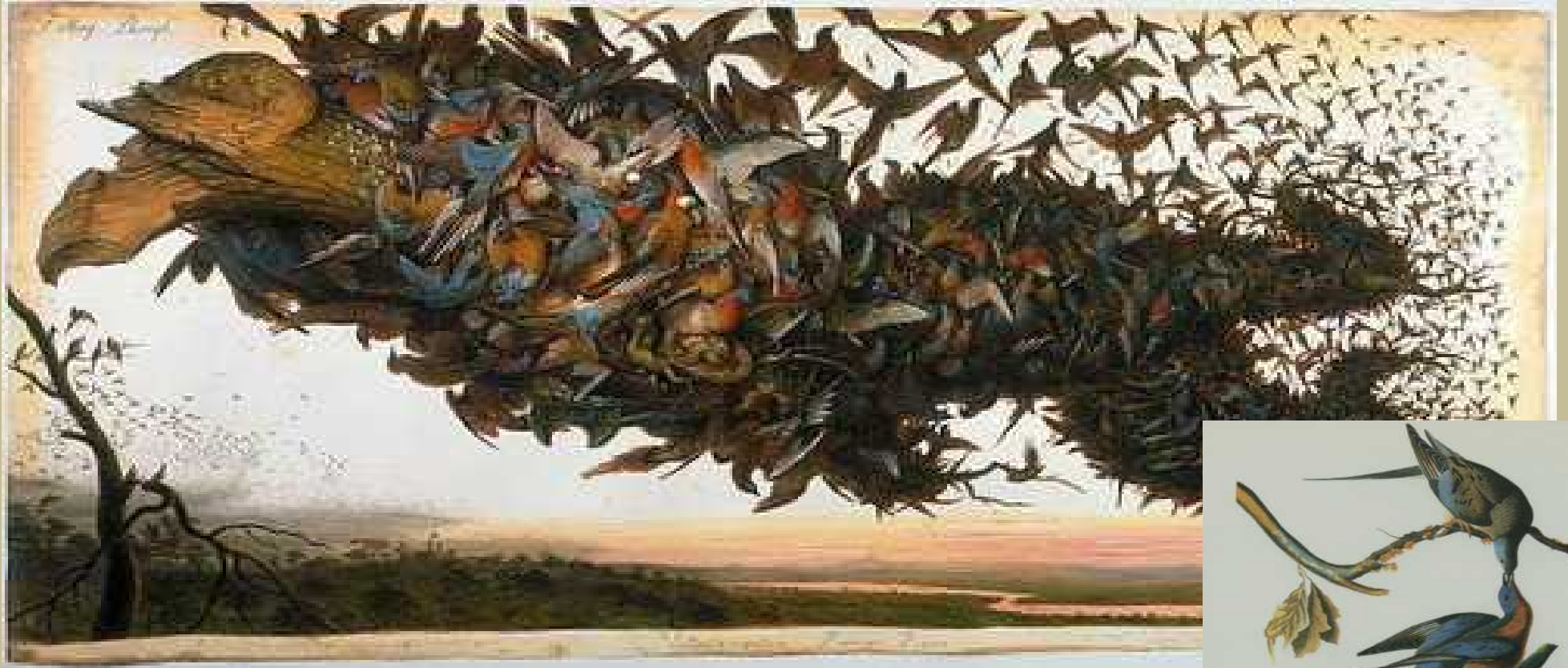
Falling Bough 2002