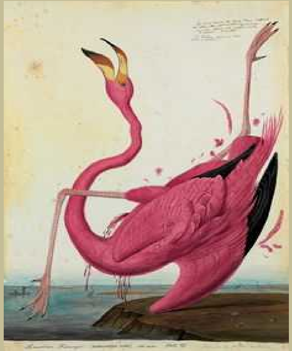
American Flamingo, 2010

Life sized images filled with symbols, clues and jokes, referencing a multitude of texts from colonial literature and folktales to travel guides.