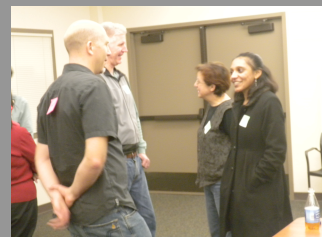
Naming Stereotypes activity