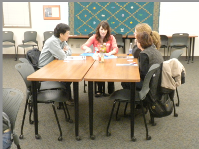
De Anza faculty and staff discuss the many issues facing their AAPI students

Phi Theta Kappa's Peers Unite to Learn through Scholarly Exchange (PULSE) is undergoing training to mentor IMPACT's LART 211 class in the Spring quarter. The first training discussed educational challenges of our Pacific Islander, South East Asian, and Filipino students. The next training will focus on defining the mentor role. The mentors will serve as coaches, guiding our IMPACT students through the ins and outs of college life.