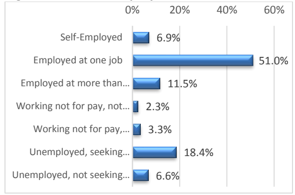
Figure 2. Current Employment Status

• Overall, statewide, students who transferred have 1.7 times the likelihood of being unemployed and not seeking employment (7.3% for not transferring vs. 12.2% for transferring), likely because they are enrolled at a four year institution.