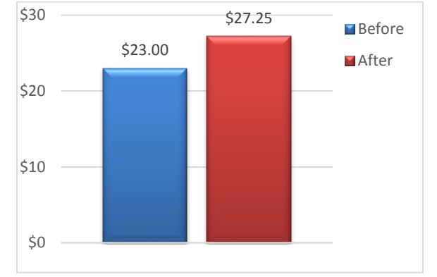
Figure 4. Earnings before studies/training and after

• Respondents were asked what impact their coursework had on their employment. Here are the reasons, listed in rank order of frequency: