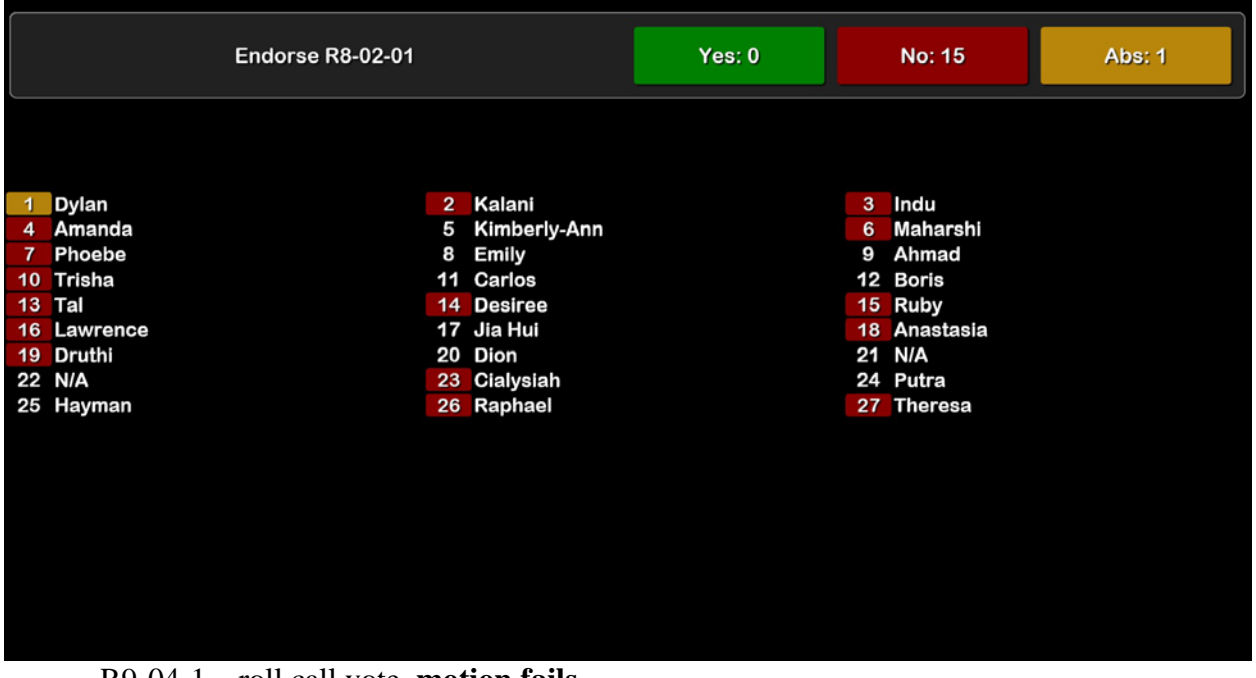
R9-04-1 – roll call vote, motion fails