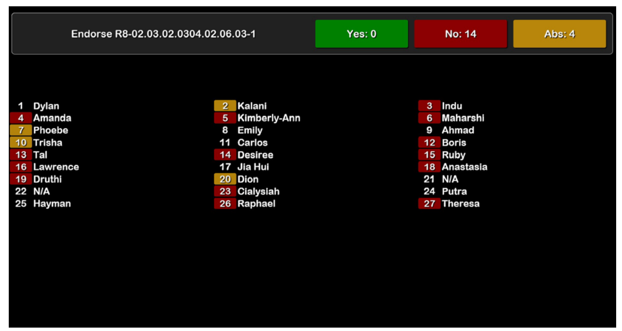
R8-02-1 – Tal moves to have the LAO to split the resolution Druthi seconds, Cialysiah objects Motion fails