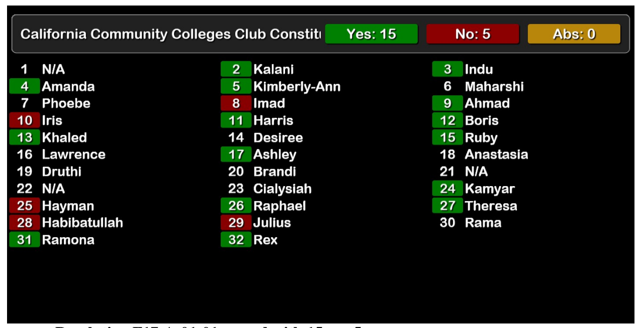
Resolution F17-A-01-01 passed with 15 yes-5 no.

Roll call vote to pass the resolution to support F17-A-01-01 California Community Colleges Club Constituency