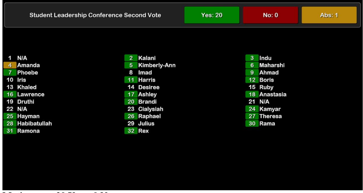
Motion pass 20 Yes – 0 No

Roll call vote to approve $2,000 from Summer/Fall Allocations to fund the Campus Wide Student Leadership Conference