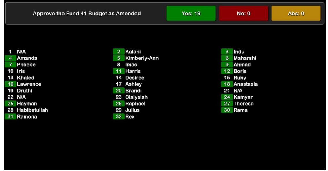
Motion passed 19 Yes – 0 No

Roll call vote to approve the Fund 41 Budget as amended.