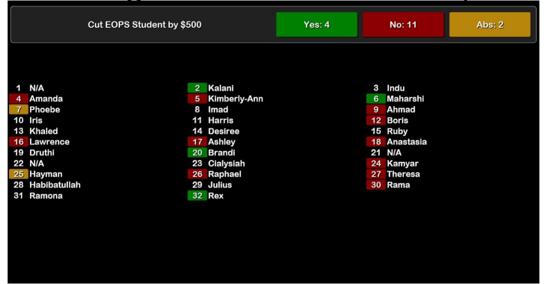
Motion failed - needs 2/3 of votes to pass

Roll call vote to approve cut Textbook Rentals - EOPS Students by $500