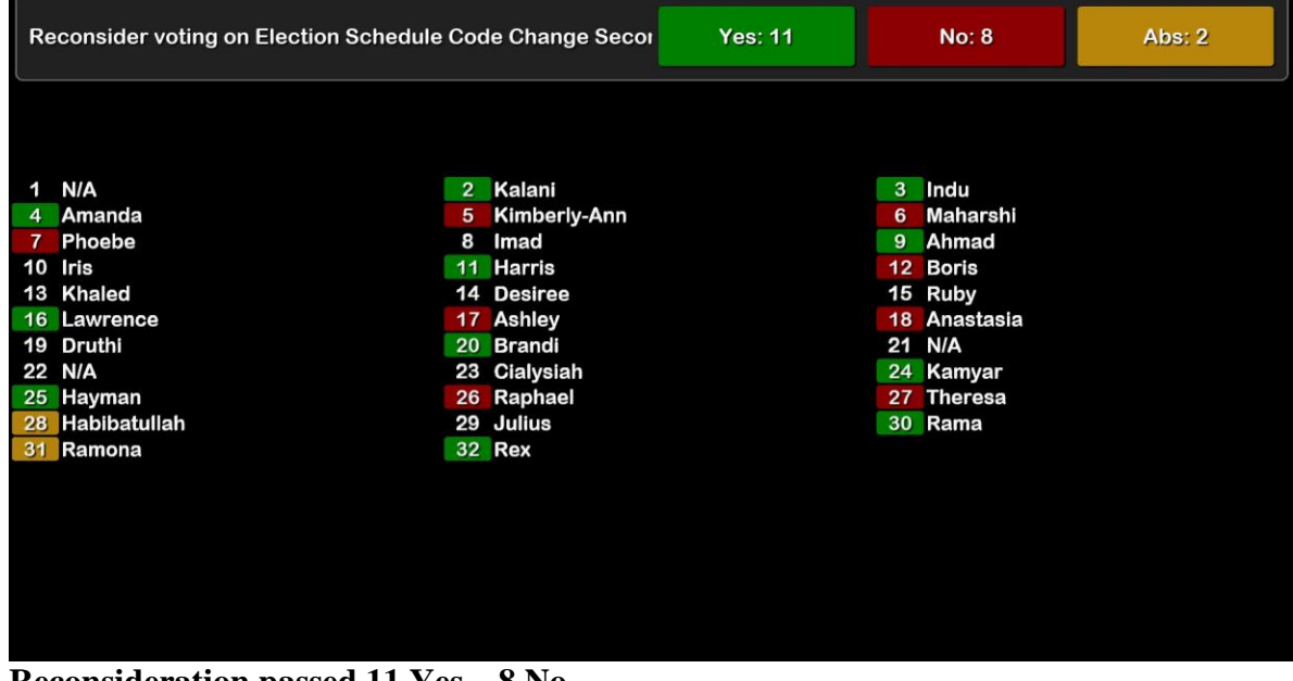
Reconsideration passed 11 Yes – 8 No.