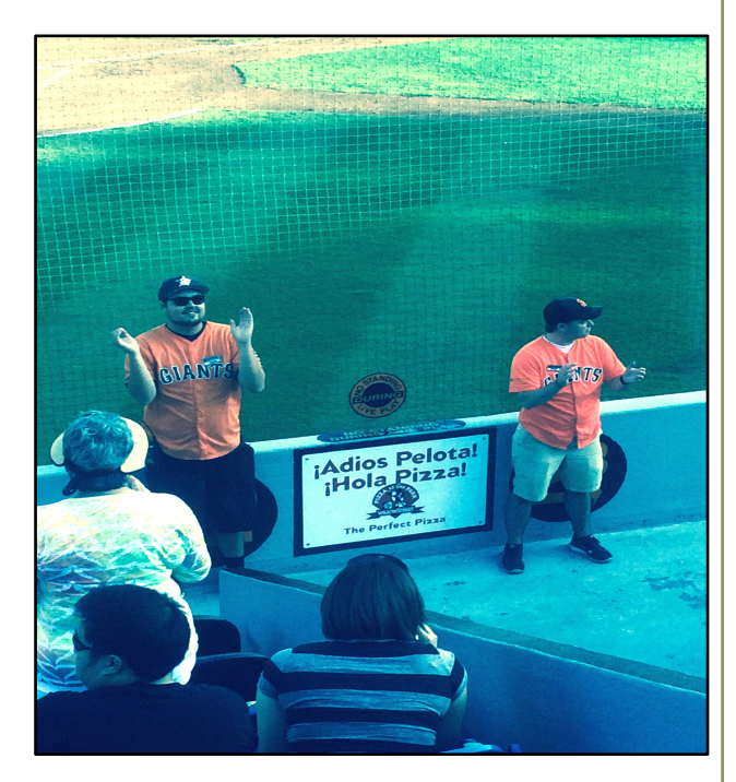
Doing the YMCA song.