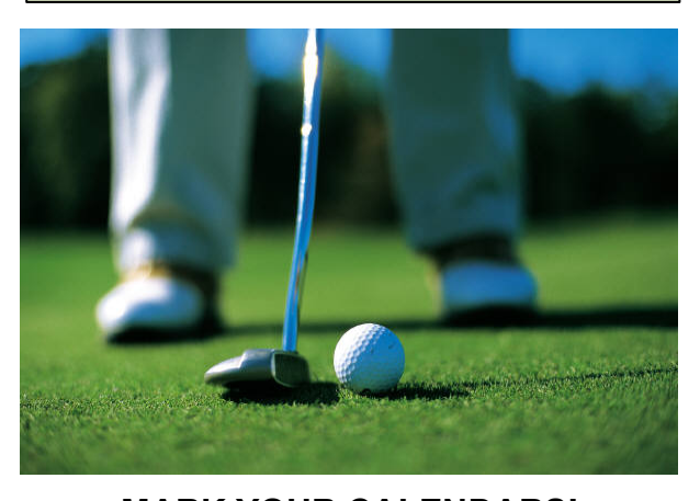
MARK YOUR CALENDARS!

The 4th annual FODARA Scholarship Golf Tournament will be held on Thursday, April 8, 2015. You don't have to play; you can come and just eat! Details will be in the next newsletter.