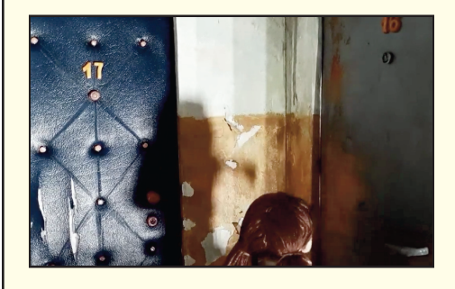
Six? Kamilla Yusupova F/TV 66A Basic Techniques of Animation: Stop Motion 0:36

A small girl goes to visit her friend in the same building, but when the door opens, she encounters someone else.